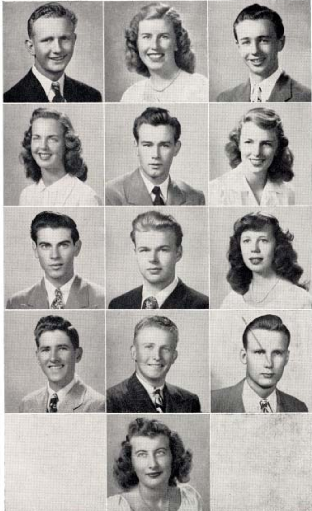
WEBER WELCH WENTS WIDFELDT