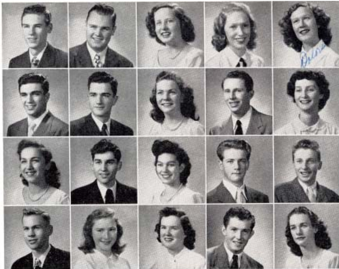
CHAPUIS CASTEN CHIGRIS CHURCH