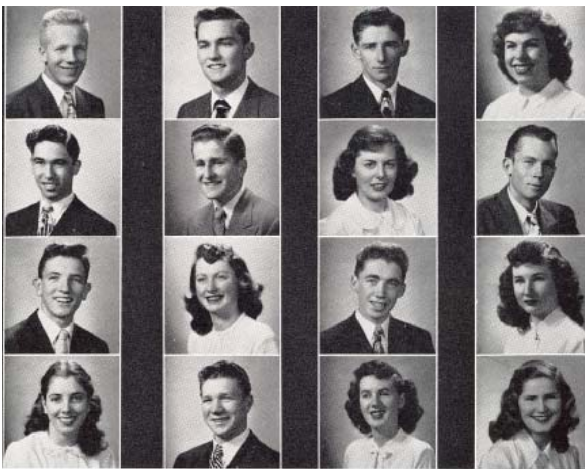
SOLARI SOLTOW SPERISEN SPEILBAUER