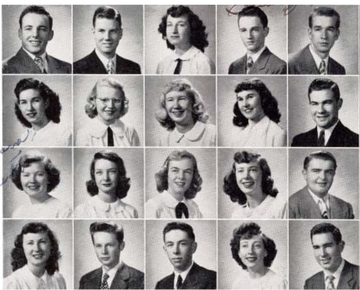
FIORE FISCHLER FLAHERTY FLAHERTY