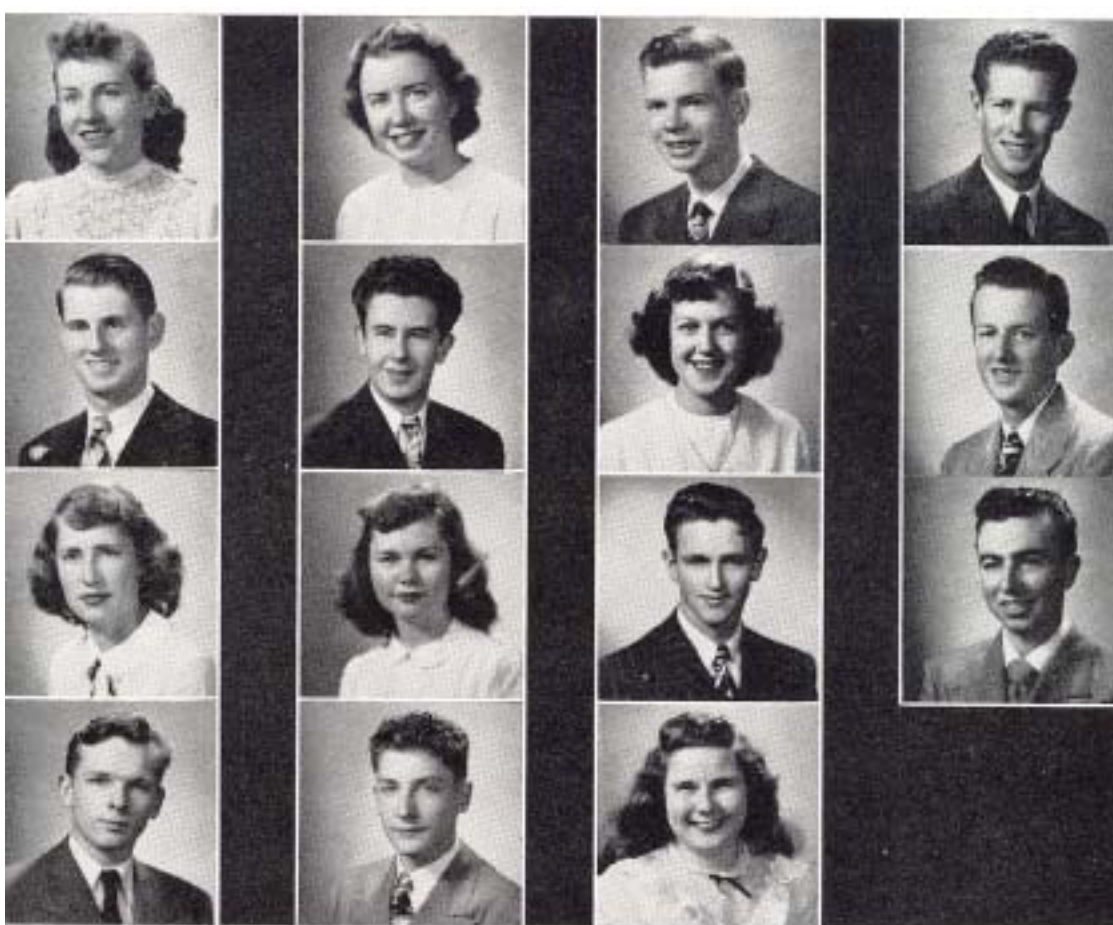
WEST WESTON WHITTEN WILKINS