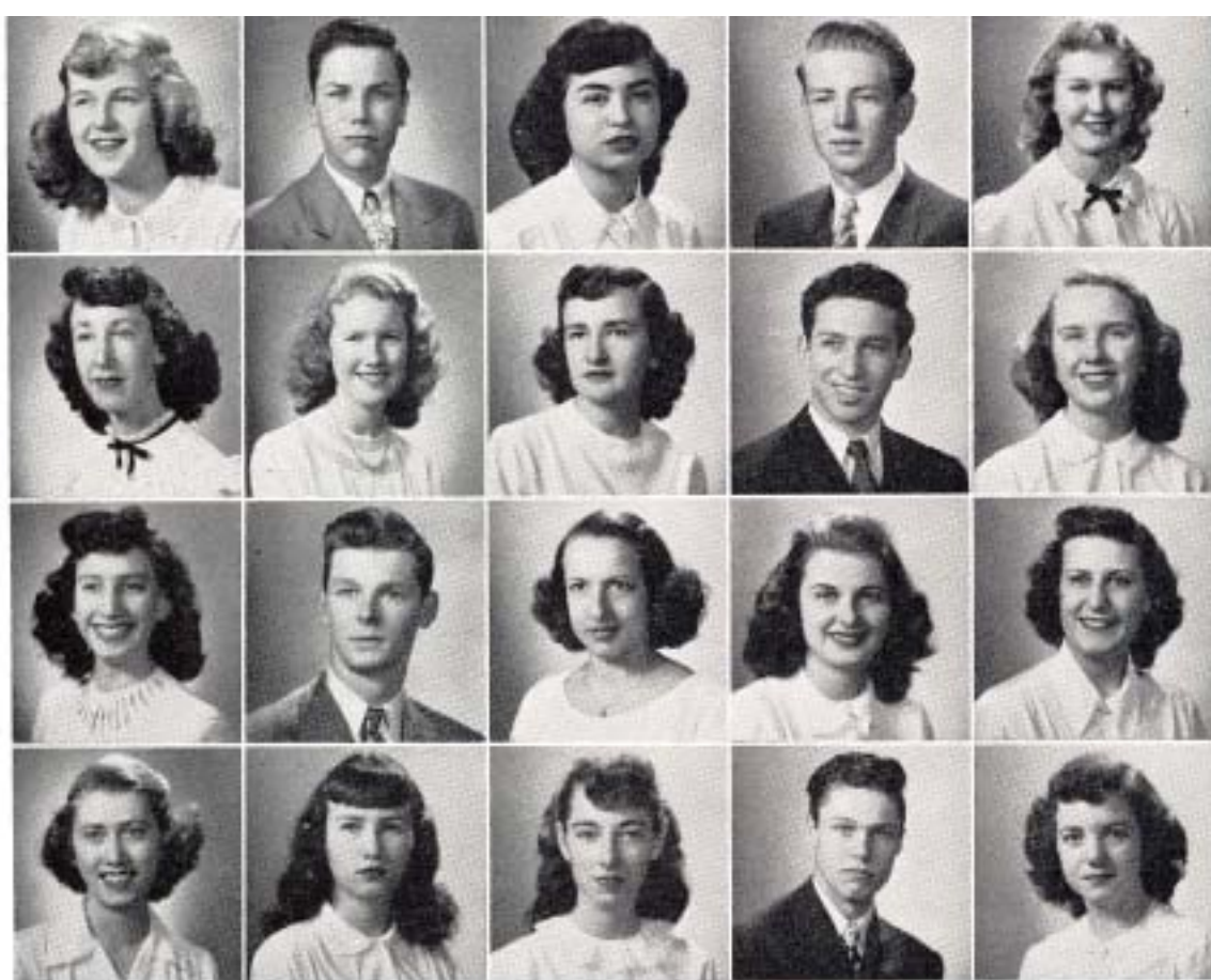
SCHAUMLEFFEL SCHLOCKER SCHLOSBERG SCHMEDINGHOFF