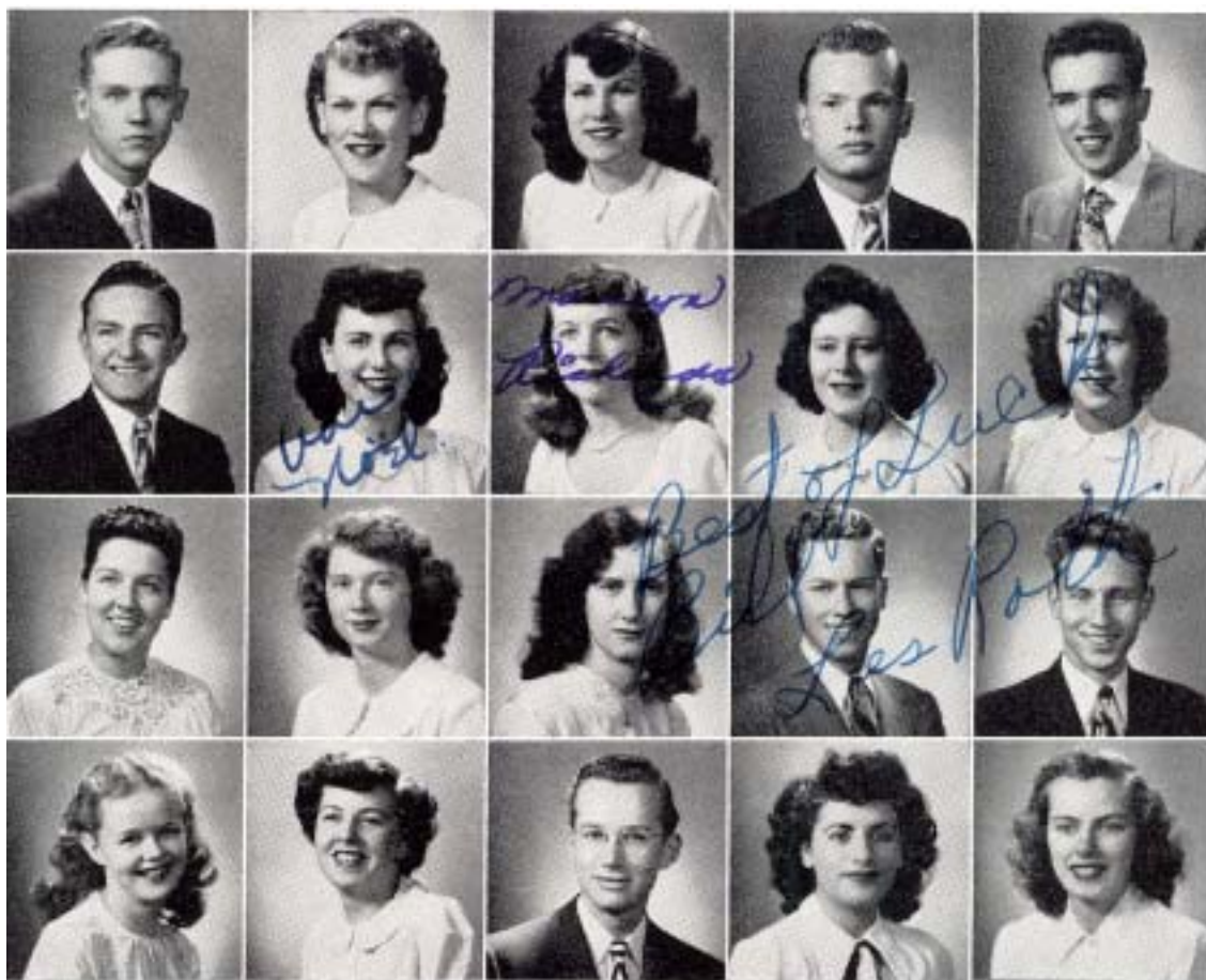
PUTZAR PYNCH RAINEN QUENT