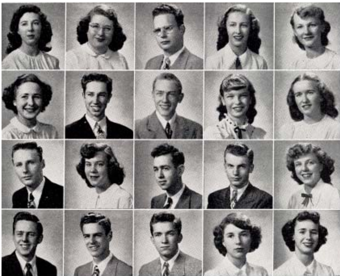
DELANY DE PAOLO DERHAM DESIN