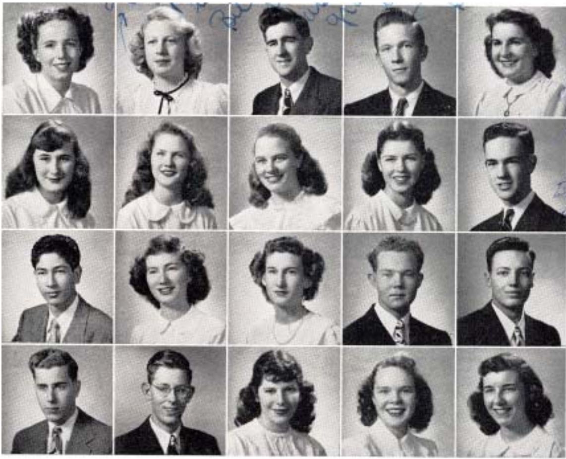
GAMLEN GANN GAVIDIA GEDDES